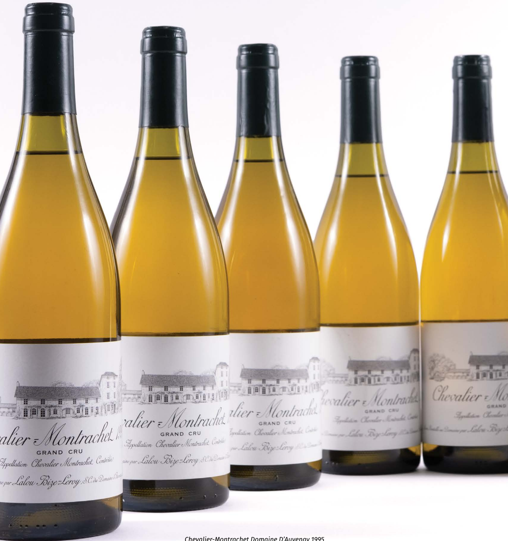
Chevalier-Montrachet Domaine D'Auvenay 1995 $100,000 (Ten 750ml)