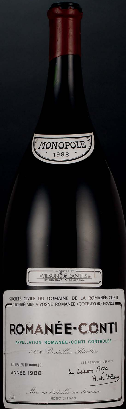
Romanée-Conti DRC 1988 $150,672 (One 6L)